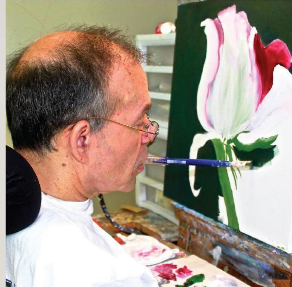
American Artist- MFPA USA