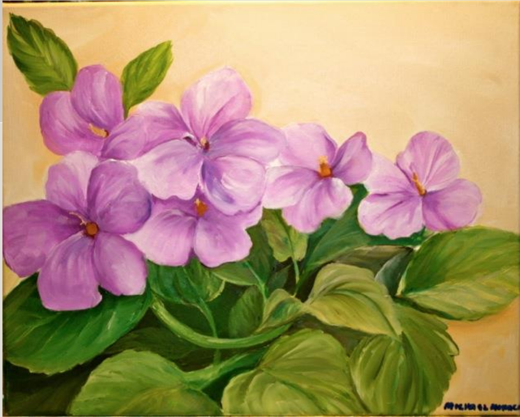
Michael Monaco Purple Flowers Acrylic Paint N/A