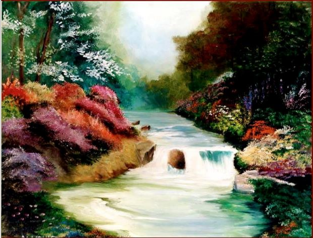
Michael Monaco Heaven Garden Acrylic Paint N/A