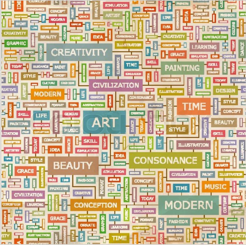
Seamless Pattern